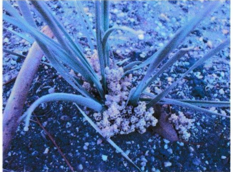
Lomandra bracteata Perennial tussock loma Gr: fringe referring to anthers in some species, andros Gr: man bractea L: thin plate of shining metal

The species featured in July's newsletter and named as Lomandra multiflora was actually Lomandra filiformis I believe. Please note this on your copy till another verdict comes along. ☼